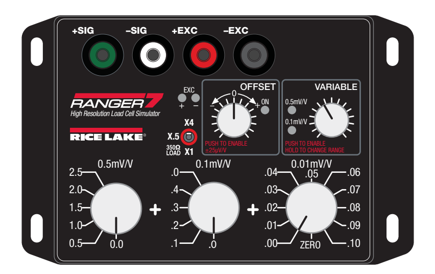
Figure 1-2. Ranger 7 Simulator