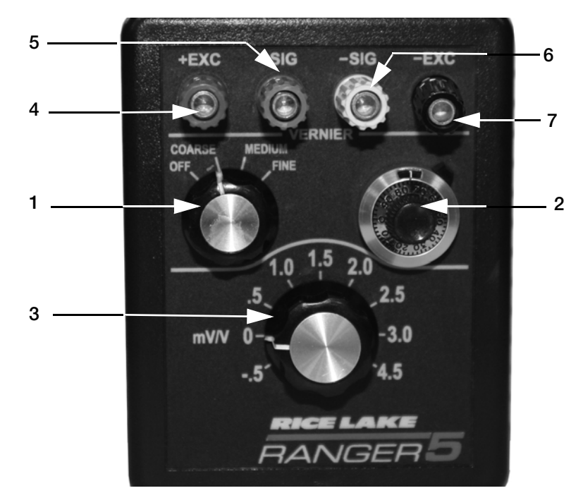
Note The vernier is included as a diagnostic and setup tool only.